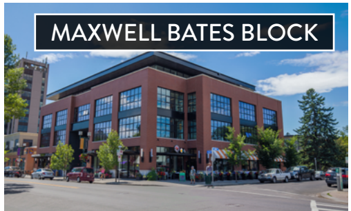
MAXWELL BATES BLOCK