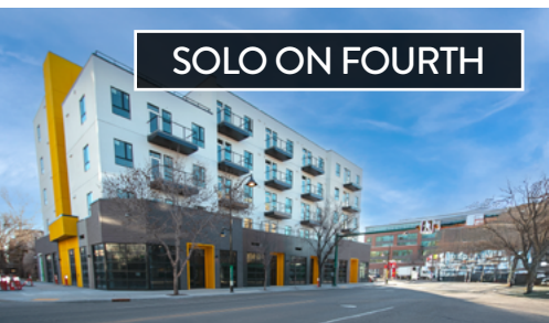
SOLO ON FOURTH