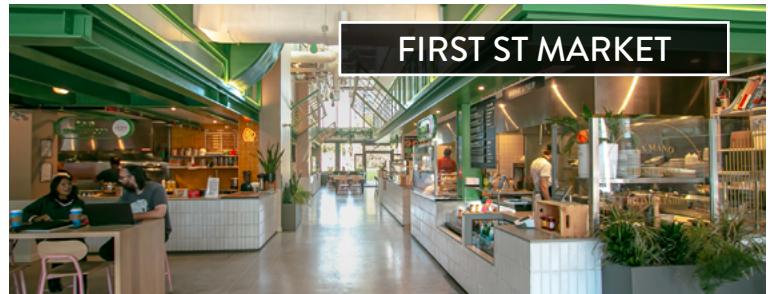
FIRST ST MARKET