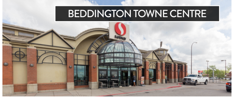
BEDDINGTON TOWNE CENTRE