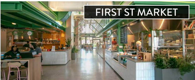
FIRST ST MARKET