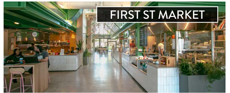
FIRST ST MARKET