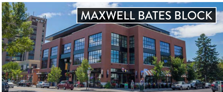
MAXWELL BATES BLOCK