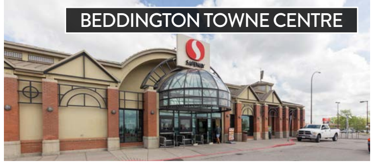
BEDDINGTON TOWNE CENTRE